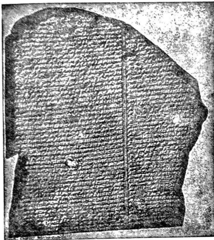
The Rosetta Stone

Space would not permit quoting a large number of other prophecies just as specific as the ones we have considered, and just as convincing. The pages of Holy Writ abounds in daring forecasts concerning Jerusalem, Judea, the twelve tribes of Israel, Samaria, Philistia, Moab, Gaza, Chaldea, Syria, Nineveh, Medo-Persia, Greece, etc. Many of these prophecies have already been fulfilled, while others are in the process of being fulfilled.